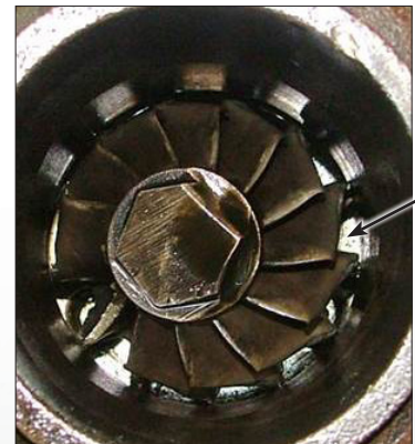
Damaged Turbine Wheel

All cores must be returned in the original box to receive full core credit.