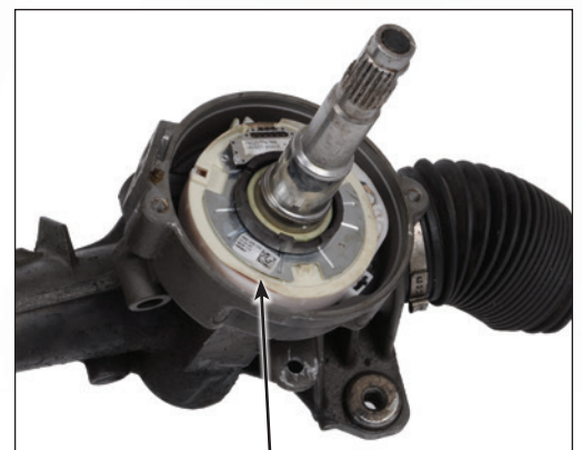
Missing Pinion Cover